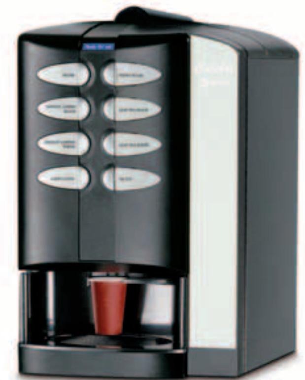
Leaf Tea model